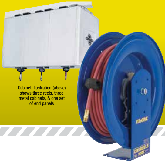
Cabinet illustration (above) shows three reels, three metal cabinets, & one set of end panels

COXREELS® EZ-E Series “Expandable” multiple bank system is the pinnacle in professional appearance and organization. The cabinets are interlocking and expandable to any number of spring driven reel assemblies required. Designed for easy installation, maintenance and servicing the EZ-E Series system is truly the professional’s choice for multimedia delivery in one custom package.